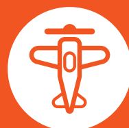
Fixed Wing Plane