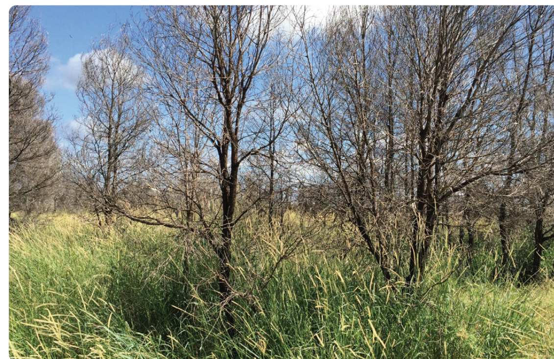
Photo: Brigalow, 18 MAA, Durong Qld

Tebuthiuron may cause temporary herbicide symptoms on susceptible species. Careful planning on timing and rates will ensure an efficacious result with minimal impact on desirable grasses and forbs. Most species recover after adequate rain.