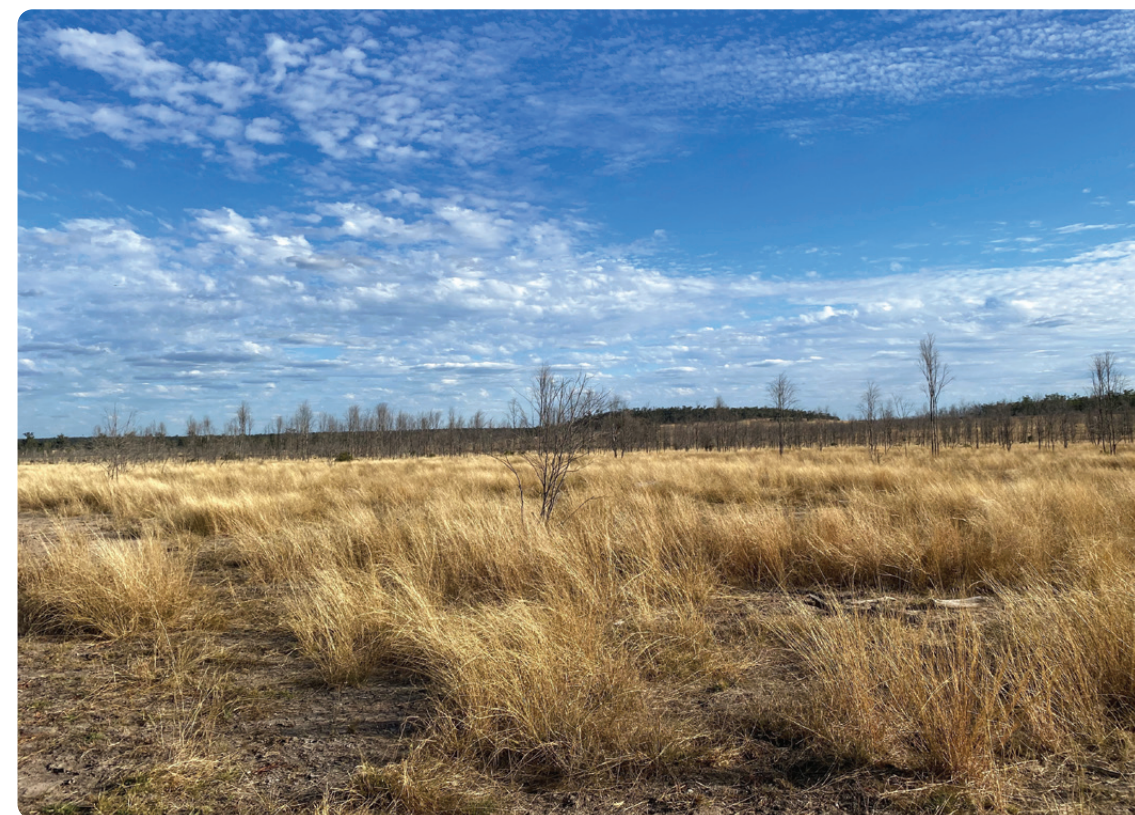
Photo: 24MAA Regain 400, Box Iron Bark country, Chinchilla

GP Regain 400 is an aerial only product and includes an all inclusive on-farm service with any purchase.